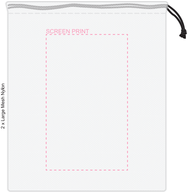
2 x Large Mesh Nylon