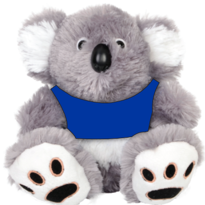
Sample of finished product. Approx. 30% size